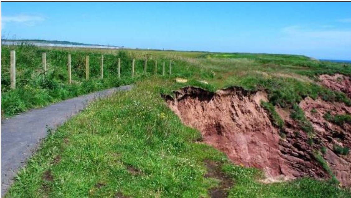
Section of Seaton Cliffs Path.

Discussions continue on options for the section of path at Carlingheugh Bay, with a diversion along the beach as one possible solution allowing walkers access to the path at Auchmithie and access to Seaton Den. The Scottish Wildlife Trust is now in discussion with neighbouring landowners to acquire the land as required to implement the recommended actions.