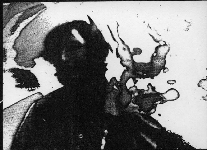
Videvent 1973–1975 (installation views and stills)