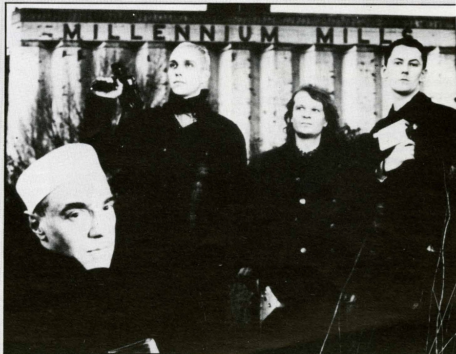
'THE LAST OF ENGLAND'

An engrossing and credible suspense thriller - sunlit horror in suburbia. Susan marries mild-mannered Jerry, but her teenage daughter feels resentful of her stepfather, and things don't go too well. Gradually, his past begins to catch up with him, and Jerry secretly starts to plan out a new identity, giving up his job and finding a new place to live. He has been through this before, and his identity crisis signals an outburst of murderous fury at his failure to create the carefree family he so much desires. Director Joseph Rubin, with Terry O'Quinn, Shelley Hack, Jill Schoelen. USA. 1986. 98mins.