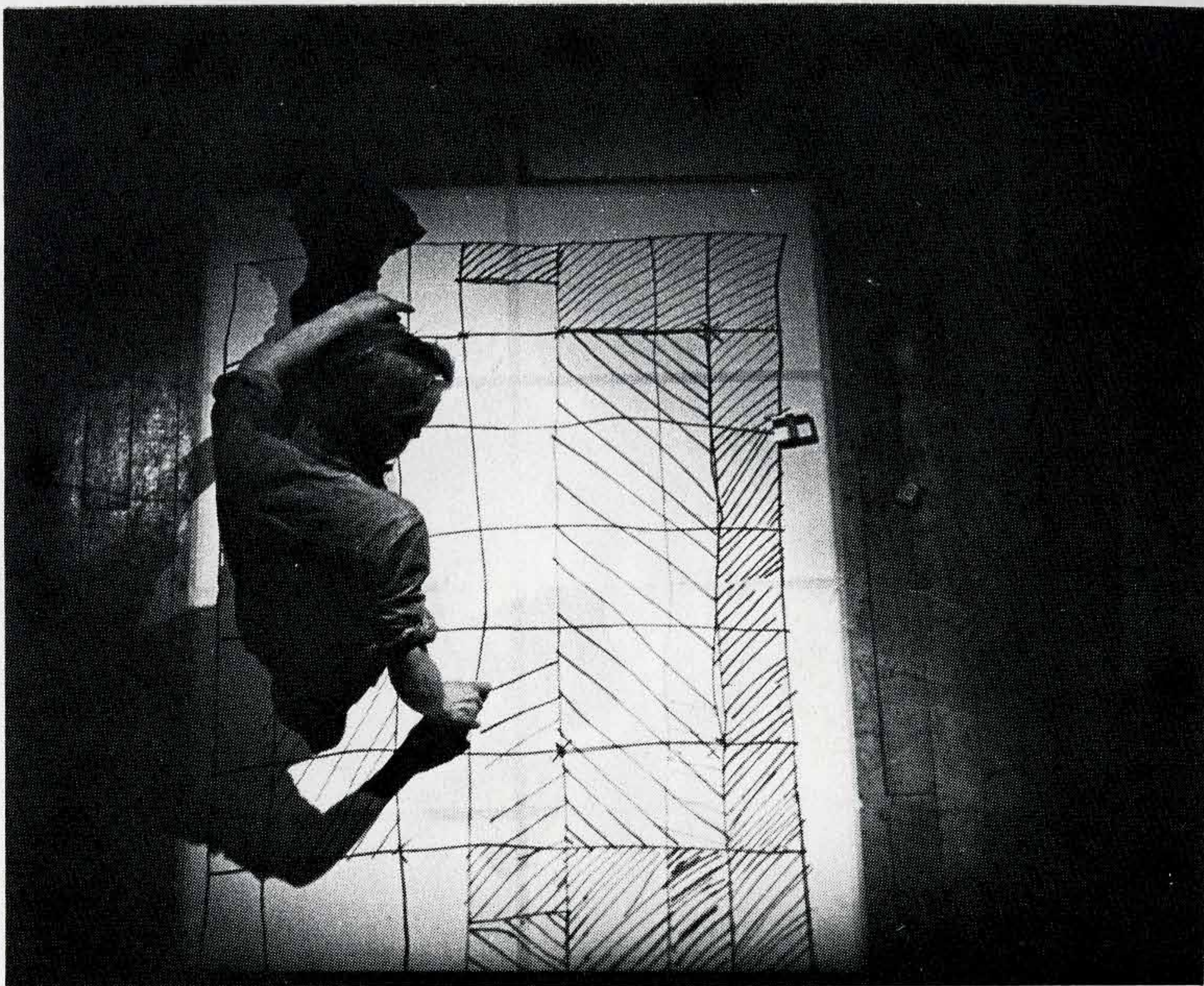
A Work Opened Up – performance, 1976