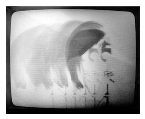
Vidicon Inscriptions: The Tape, 1973 Single screen black & white video, with sound Duration: 6 mins

This work captures the video's capacity for real-time image-making through the use of ghostly traces of light, which are burnt into the tube's photoconductive signal plate.