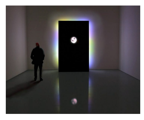
A Situation Envisaged: The Rite II (Cultural Eclipse), 1989 Fifteen monitor video installation, with sound 287 \times 179 \times 51 cm approx. (installation) (DHA002)

"In this work, Hall plays with the experiences of real-time and the video copy, presenting in several iterations a fragment of World War II footage taken from the point of view of a fighter plane as it machine-guns targets on land and sea. Using a Russian-doll structure of images repeatedly rerecorded and reframed, Hall toys with the viewer's manifold experiences of live and recorded time: the historical time of archival footage, the live experience of watching it on a screen, the déjà vu of watching that 'live' footage again on another monitor. This nesting of recorded images within other recorded images implies an emergent sensibility in which the present moment is continually being recorded and reframed by audiovisual apparatus." Leo Goldsmith, Artforum, January 2015.