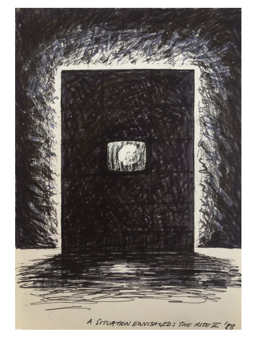
A Situation Envisaged: The Rite II, 1988 Pencil, pen, felt-tip pen and correction fluid on paper 30 \times 21 cm (DHA010)

This work is the third from the Situation Envisaged series (started in 1978), made for Video Positive '89 , held at the Tate Gallery, Liverpool (1989). 15 monitors are stacked as a single block close to a wall. TV broadcasts reflected on the wall form an aura of changing light. In the centre, on the only screen to be seen, is a 30 line image of the moon shot on a 'camera'/ scanner identical to that first used by John Logie Baird in the 1920s. The sound (by David Cunningham) is derived from multiple broadcast channels and composed as a musical score.