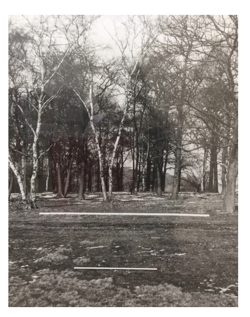
Richmond Park Series, 1967–68 5 Black and white photographs 50 \times 39 cm | 39 \times 50 cm approx. (DHA007)

A photograph documenting a work presented in 1970 at the ICA, London in the exhibition British Sculpture Out of the Sixties . The artist reproduces on the floor one of his hexagonal sculptures by means of "removal": the sculptural element is the result of sanding the gallery floor.