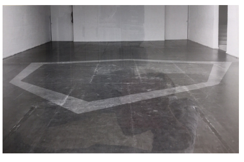
Displacement (Removal Piece), 1970 Black & white photograph 48 × 76 cm (DHA008)

This single-take film, using a fixed camera, explores a shift in perception from the screen surface as a physical area to the illusion of three dimensions in a filmed image. A partial view of a room is slowly revealed, and hints of colour are introduced eventually transforming the 'flatness' of the initial monochrome view into the more illusory image of the actual space recorded.