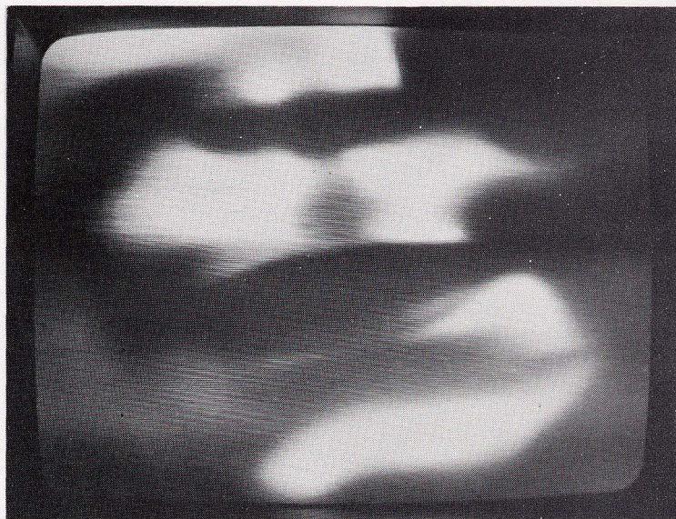
'THIS IS A VIDEO MONITOR'