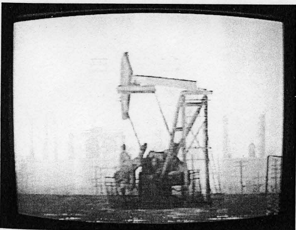
Anthem , Bill Viola

Bill Viola manages to resolve very disparate material and maintain a narrative momentum in Anthem by his very precise editing. Because of the passivity of the camera, always still with no zooms or pans, the edits function like the ticking of a metronome, and the final