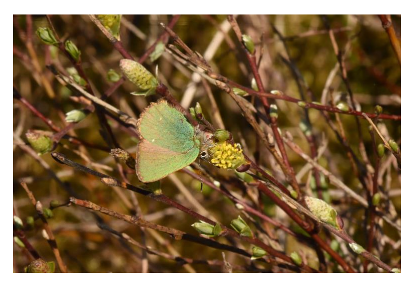
Green Hairstreak butterfly on Creeping Willow