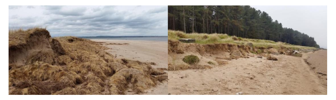
Images of the erosion: Image on the left is in the northeast area and the image on the right is at the north end by the sea fence.

This year's dynamic coastline changes have been astonishing especially at the north point and the dune edge erosion around the north eastern section has changed and the foreshore has built up.