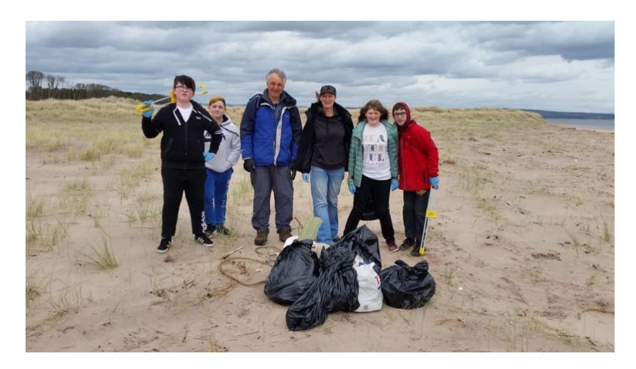
Auchmuty High School group carrying out a beach clean. A big thanks to the working party.

estimate is well over 8000 students visiting. This Outdoor Classroom style is an important part of the education curriculum for pupils and students of all ages.