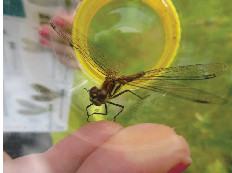
Female Black Darter by Daniele Muir

This summer we are keen to start a Dragonfly Recording Transect and are looking for volunteers to take part. The route of the transect goes past meadows, woodland, small ponds, ditches and the lochs, so includes a variety of beautiful habitats where dragonflies and damselflies can be spotted.