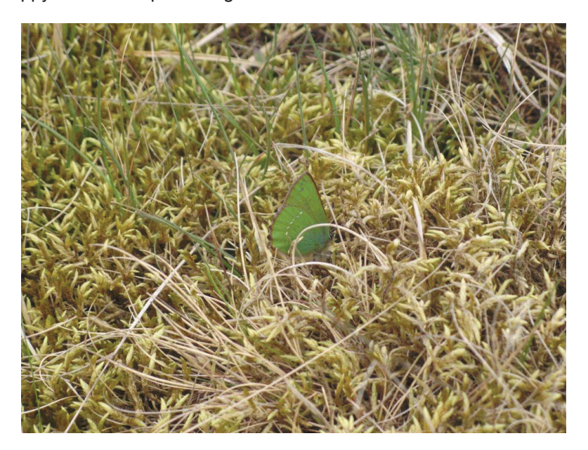
Green hairstreak butterfly.