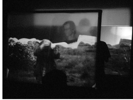
Paper Landscape (1975–2008)

illusory image of myself appear tearing the paper away to reveal the landscape. So the emphasis switches more and more to my recorded image, as the real me becomes progressively walled in.'