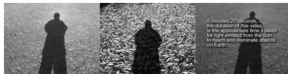
Self Portrait — After Raban Take Measure (2008)

Self Portrait looks for an approach to a specific relationship between the duration of a work and material conditions in the projection, as did William Raban in the film-performance Take Measure . The main difference is that Raban's work was made when cinematic media had distinct physical properties linking medium directly to image—this self portrait recognizes that there is no such simple materiality for cinema following the emergence of digital processes. Instead the work takes a conceptual base—the speed of light and the time taken for light to travel from the sun to illuminate objects on earth—thus the duration of 8 minutes 20 seconds.