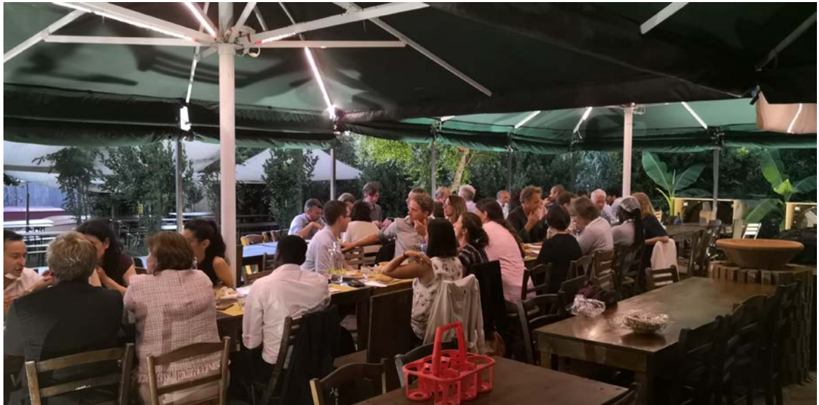
The workshop engaged a wide range of stakeholders including public authorities, sectoral stakeholders, businesses and the research community. The participants contributed to the discussion with concrete examples from their respective countries.