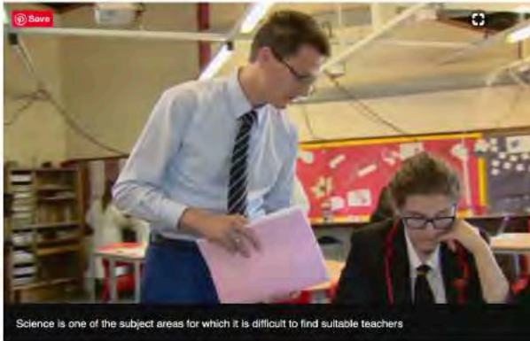
Science is one of the subject areas for which it is difficult to find suitable teachers

Several Scottish councils are warning they are finding it hard to recruit new