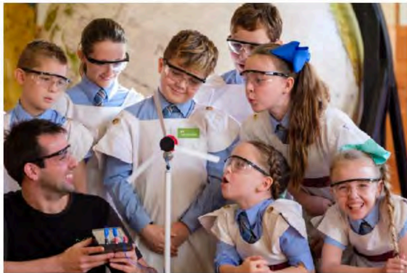
The organisation's initiatives include teaming up with National Museums Scotland.